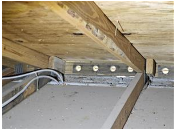
Roof to wall attachments(single straps)