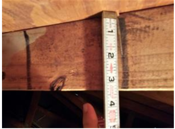
2.5in. 8d ring shank nails