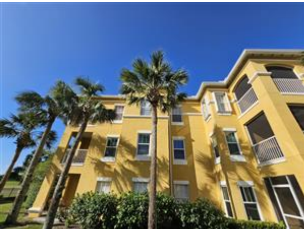
Not all openings are not protected