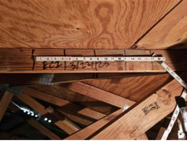
6in. nail spacing